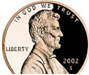
Homeowners Get a Bailout This Year LendingTree