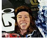
5 Richest American Olympians At Sochi Bankrate