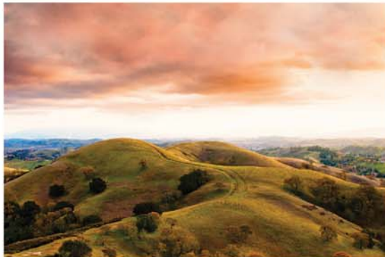
The Tri-Valley sunset

POSTED ON JULY 2, 2014 BY PUBLISHER IN COMMERCIAL, INDUSTRY NEWS