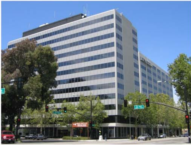
Community Towers in San Jose

formerly known as RREEF. The listing agent on the property is JLL. Both the real estate investment company and the broker declined to comment for this article.