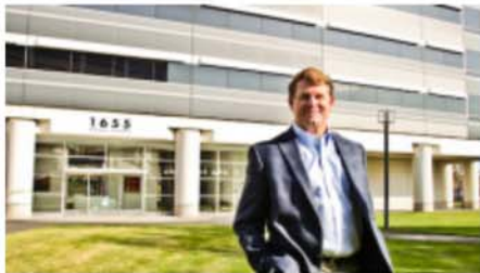
Swift Realty Creates a $1B Investment Fund