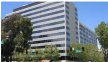
Swift Realty Pays $129/SF for San Jose Buildings