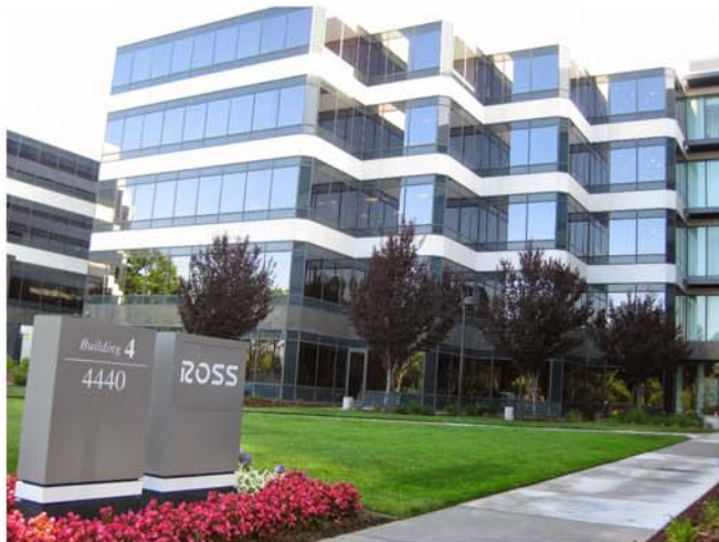
California Center in Pleasanton

POSTED ON APRIL 16, 2014 BY PUBLISHER IN COMMERCIAL, FINANCE, INDUSTRY NEWS