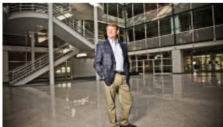
Peatross: Ahead of the Curve