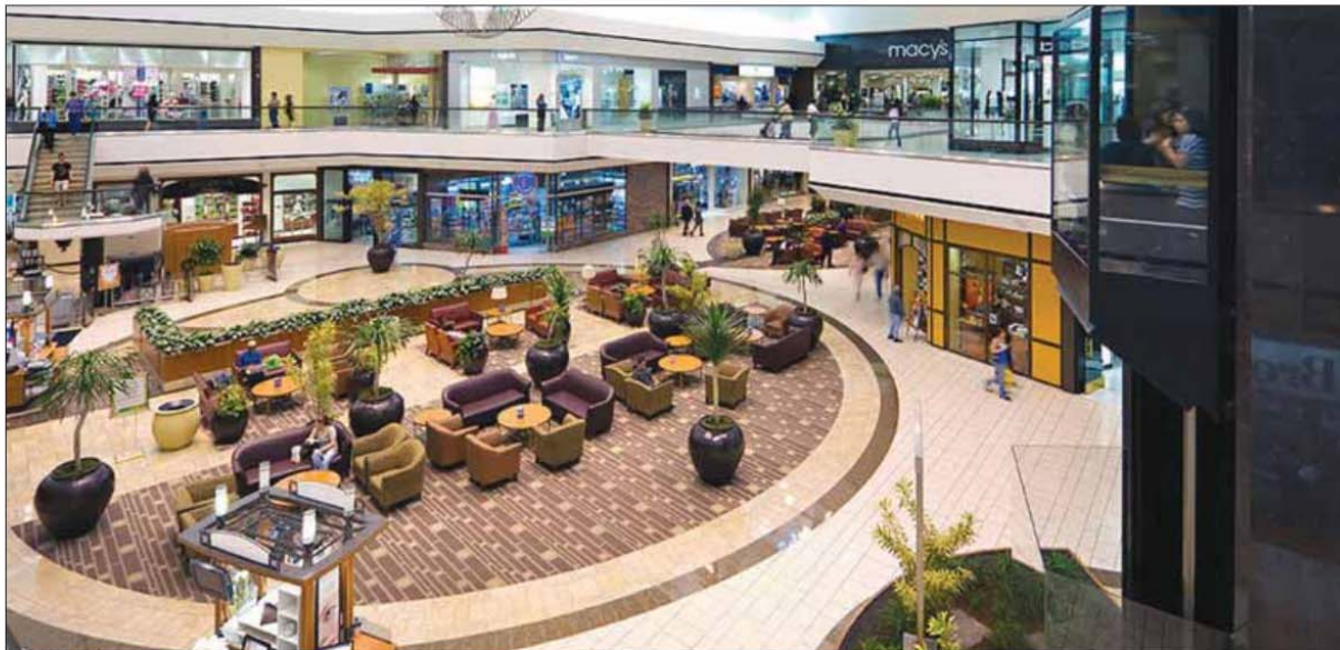
STONERIDGE SHOPPING CENTER/SIMON

Businesses of all sizes, from small offices to regional operations centers to large company headquarters, position the city as a regional employment center with more than 53,000 jobs. This breadth and diversity of companies adds to the strength of Pleasanton's economy by building a local supply chain