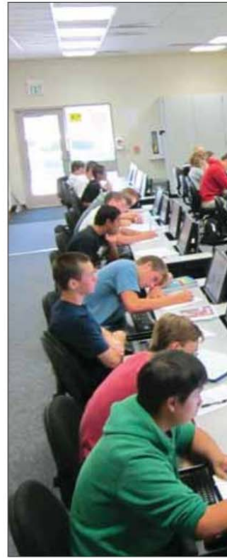
Students at Amador Valley High School in the Pleasanton school district.

Some of Workday's 1,600 employees head back to their offices at the software company's expanded headquarters building on Stoneridge Mall Road. This fast-growing company expects to employ 4,000 over time.