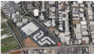
Hacienda Sees New Investment and Tenants in Recent Months