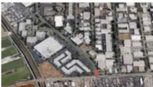
New Project Approvals, Construction Are Highlights During Hacienda's Third Quarter