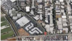
Hacienda Sees Strong Tenant Activity During Second Quarter

Tagged C2D Technology, Cloudseeder, Commercial Real Estate news, Hacienda, Innovate Pleasanton, IntegenX Inc., IronPlanet, KalpTree, M&C Association Management Services, Northern California, Pleasanton, PTI Solutions, US Ladar, VICAM, Ware Malcomb, Waters Corporation