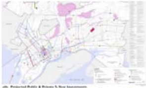
Hacienda Absorption Remains on Strong Track Through First Three Quarters of 2014