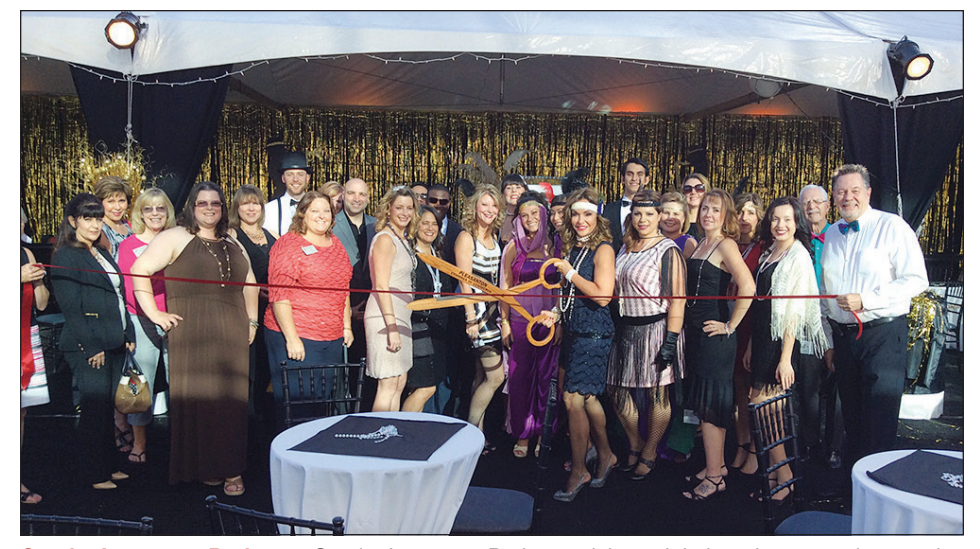
Granite Insurance Brokers – Granite Insurance Brokers celebrated their 20th year anniversary in October as one of the leading insurance brokerage and risk management firms serving a variety of businesses nationwide. Granite Insurance also hosted a "Party for a Cause" benefiting "The Great American NO BULL Challenge," which is an organization empowering students to stand up against bullying and to promote leadership, social justice, and digital responsibility through the magic of filmmaking (www.nobullchallenge.org). One hundred percent of the proceeds raised at the event went toward NO BULL Challenge. In addition, Granite is launching its new Affordable Care Act Compliant Employee Benefits Administration software, Granite HealthPro. Check it out at www.granitehealthpro.com.