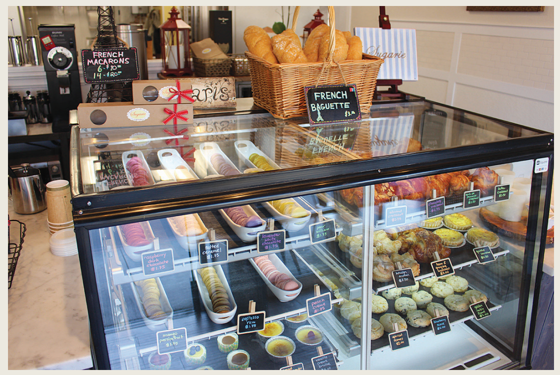
Need breakfast items like artisan coffee, Quiches and Croque Madames for your next office event? Or planning for a wedding or a baby shower? Contact Sugarie Bake Shop at www.sugariebakeshop.com.