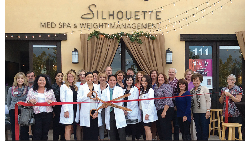
Sihouette Med Spa & Weight Management – Relax, rejuvenate, and restore your body and mind with Silhouette's aesthetic, weight loss, and spa treatments. Located in southwest Livermore just east of the Ruby Hill Golf Club, Silhouette's office and spa are designed to give you a luxurious experience complete with privacy, relaxation, and individual attention. Our highly attentive staff creates an environment that pampers and soothes, while our skilled medical professionals provide expert services in the areas of your choosing. Visit us at 101 E. Vineyard Avenue, Suite 107 in Livermore for an escape from the hustle of life, and leave refreshed, renewed, and feeling like your best self.