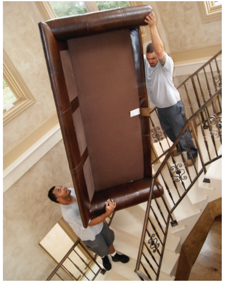
All movers are employees of the company, not day labor or temporary help. In addition to making sure each staff member is highly trained and does their job well, repeat customers are often able to request the same team help them move again.

All Reasons Moving is a certified ProMover and part of the Better Business Bureau. Find out more about them and their free quotes at AllReasonsMoving.com.